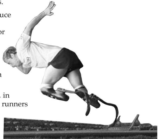
Oscar Pistorius springs off the starting line.

Pistorius is unable to produce the energy an able-bodied athlete produces with his or her calves and he must exert almost twice as much energy with his thighs, but it seems that his prosthetic feet lengthen his stride.