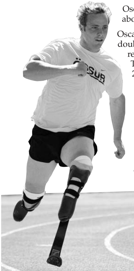
Oscar Pistorius, double amputee and champion sprinter, on his "Cheetahs" feet.